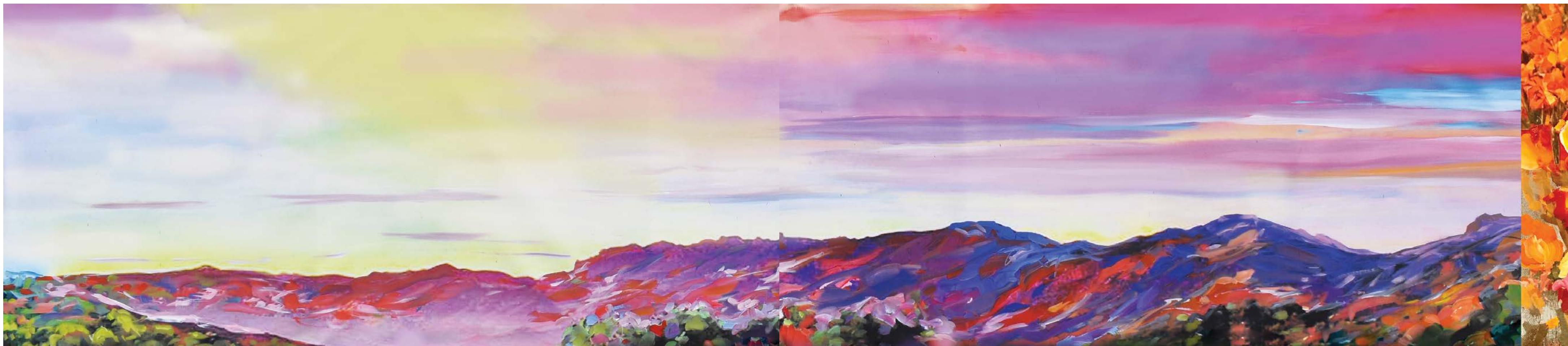
Sacred Spaces 17 , 2021. Latex and Acrylic on Printed Vinyl, 39 x 194 inches