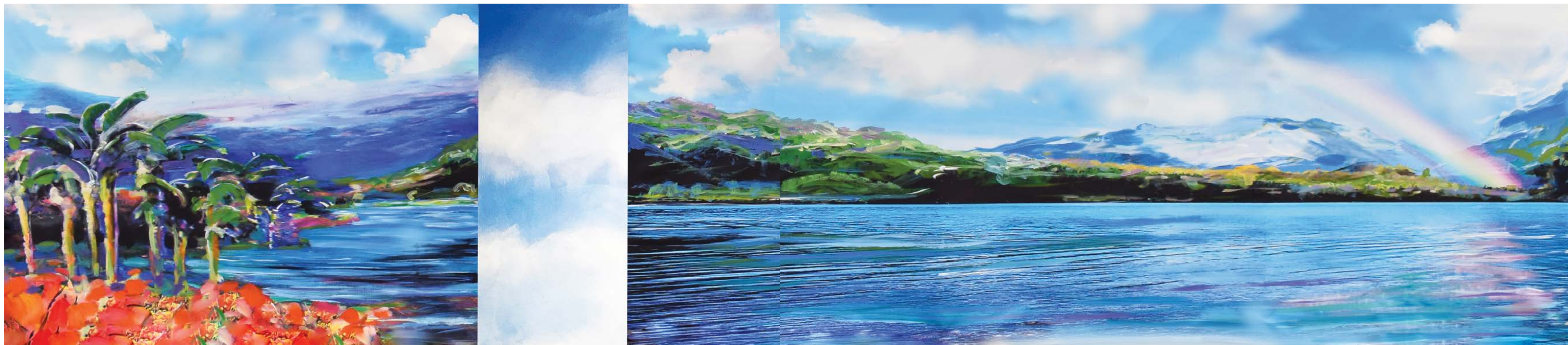
Sacred Spaces 5 , 2021. Latex and Acrylic on Printed Vinyl, 39 x 194 inches