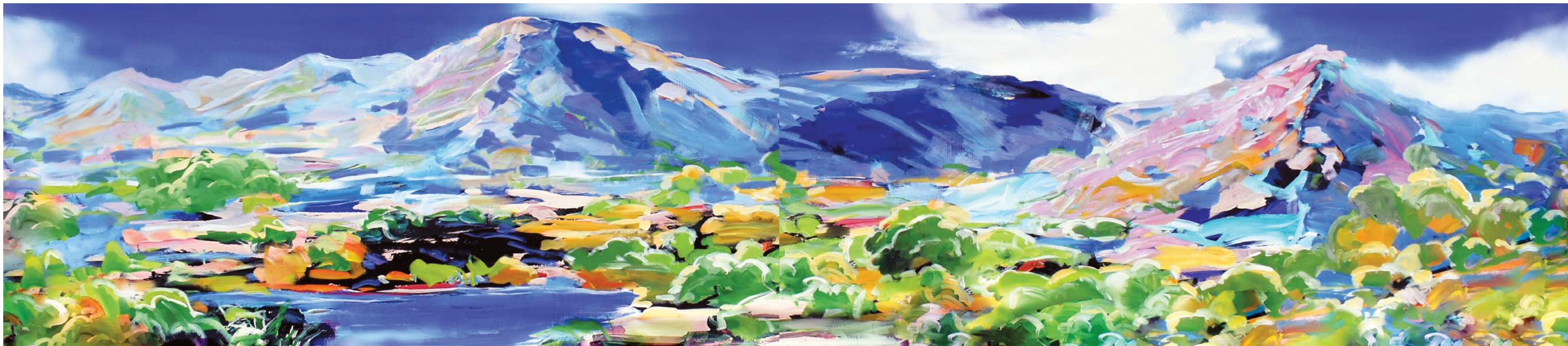
Sacred Spaces 9 , 2021. Latex and Acrylic on Printed Vinyl, 39 x 194 inches