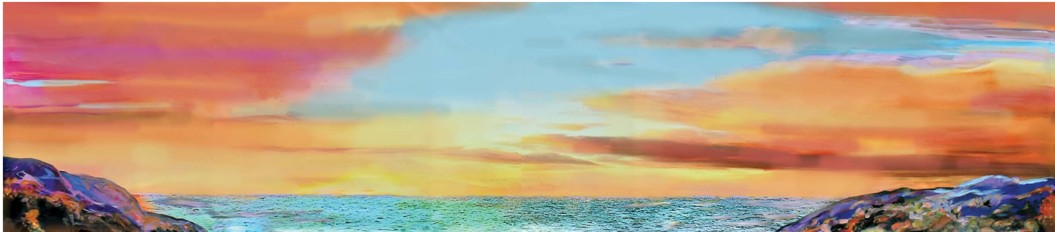
Sacred Spaces 19 , 2021. Latex and Acrylic on Printed Vinyl, 39 x 194 inches