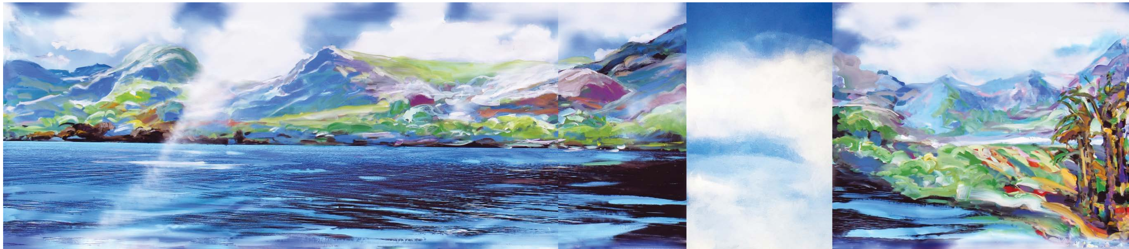
Sacred Spaces 6 , 2021. Latex and Acrylic on Printed Vinyl, 39 x 194 inches