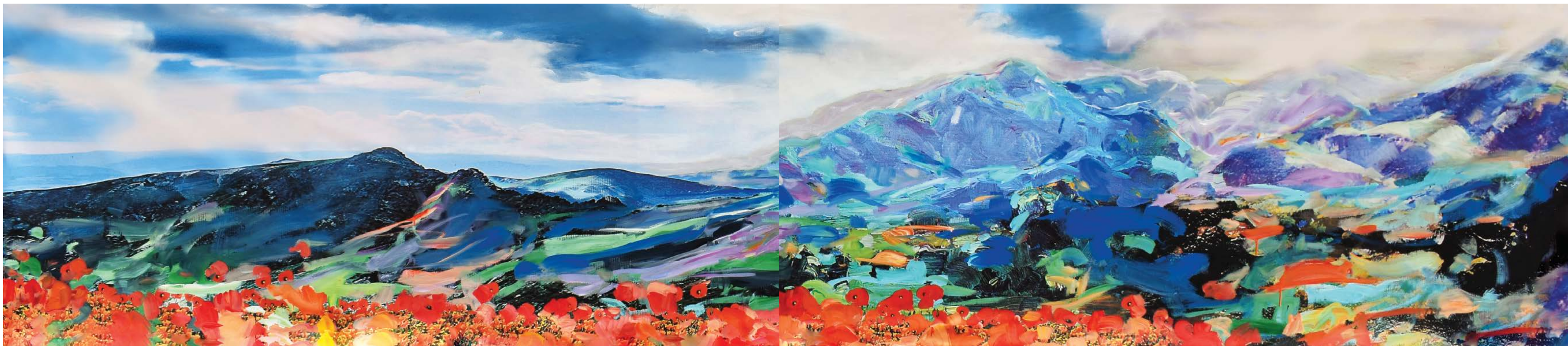
Sacred Spaces 12, 2021. Latex and Acrylic on Printed Vinyl, 39 x 194 inches