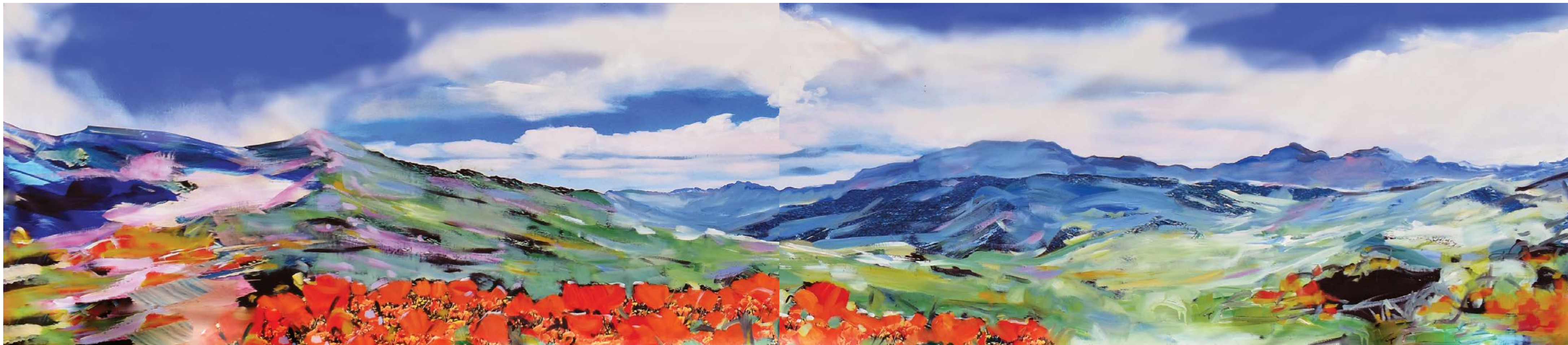
Sacred Spaces 10 , 2021. Latex and Acrylic on Printed Vinyl, 39 x 194 inches