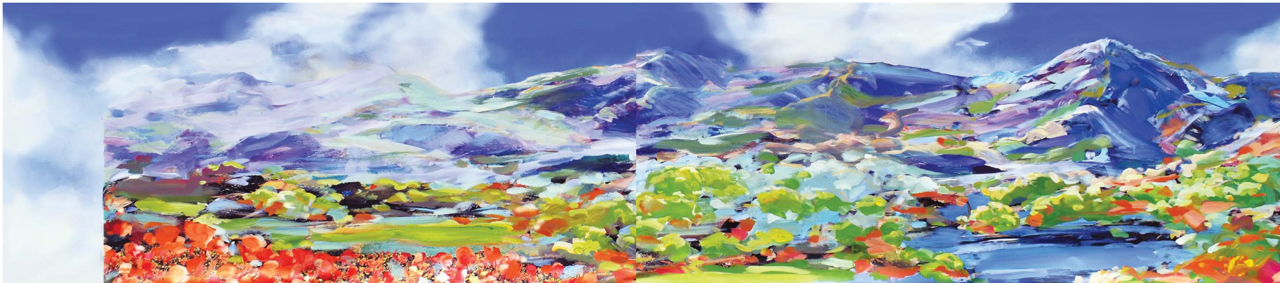
Sacred Spaces 8 , 2021. Latex and Acrylic on Printed Vinyl, 39 x 143 inches