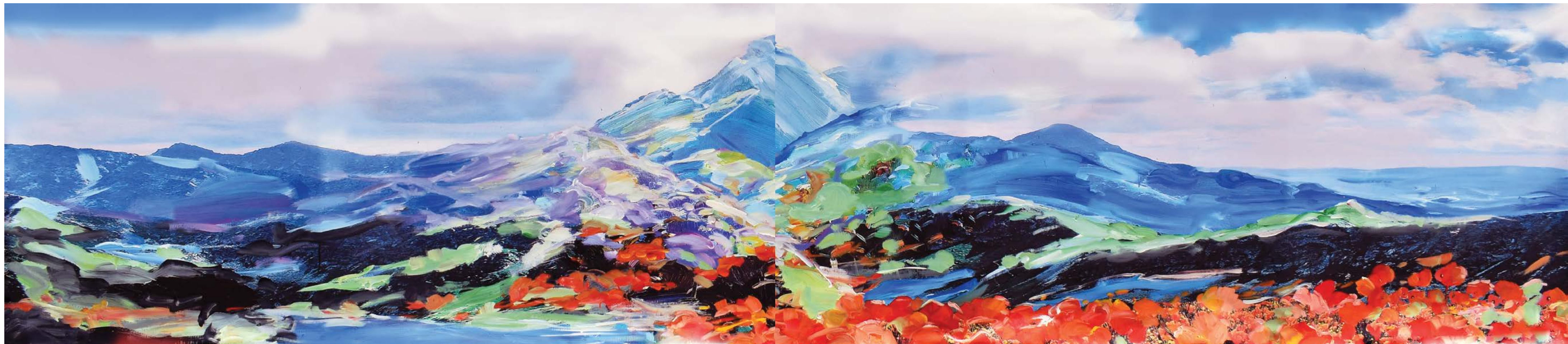
Sacred Spaces 11 , 2021. Latex and Acrylic on Printed Vinyl, 39 x 194 inches