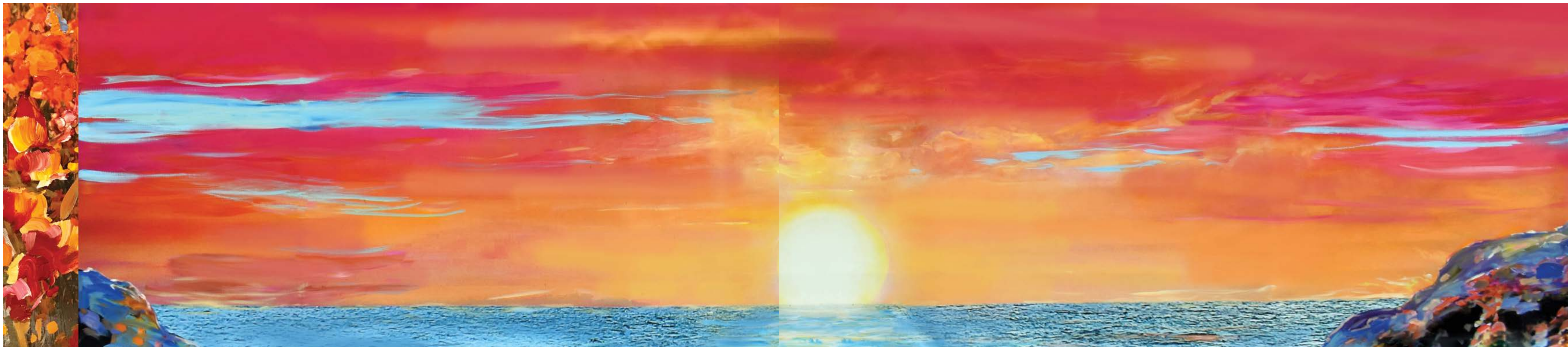
Sacred Spaces 18 , 2021. Latex and Acrylic on Printed Vinyl, 39 x 178 inches