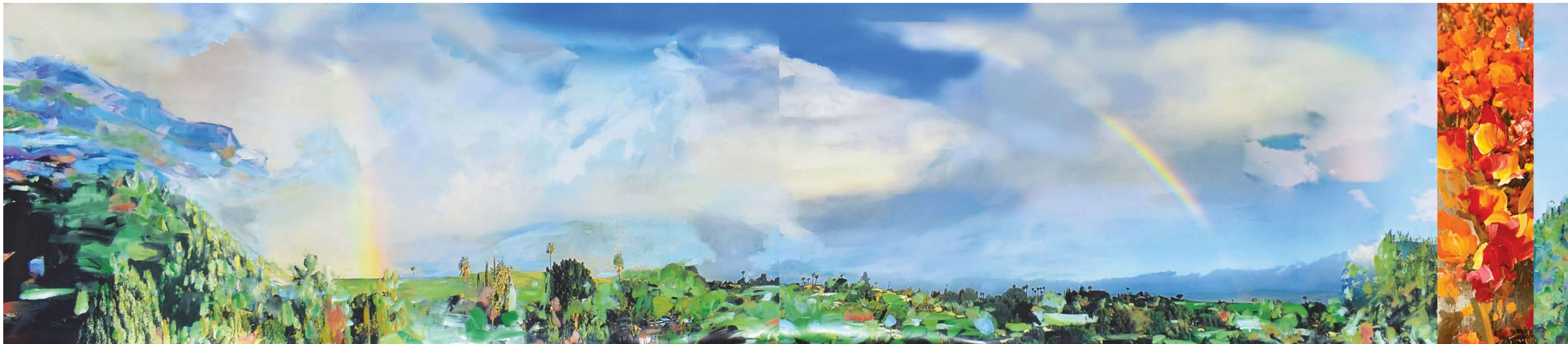
Sacred Spaces 13 , 2021. Latex and Acrylic on Printed Vinyl, 39 x 194 inches