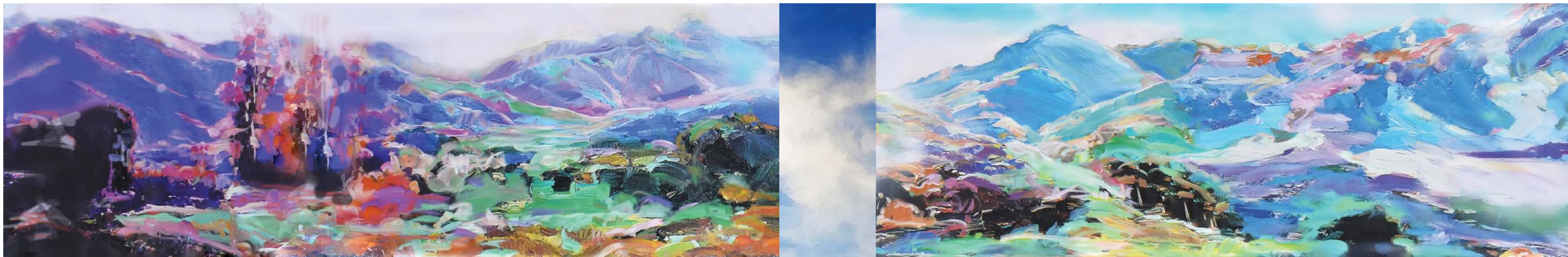
Sacred Spaces 1 , 2021. Latex and Acrylic on Printed Vinyl, 39 x 257 inches