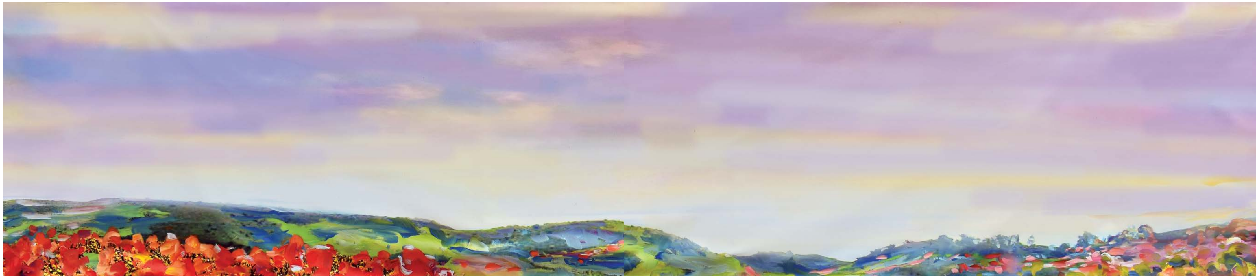
Sacred Spaces 16 , 2021. Latex and Acrylic on Printed Vinyl, 39 x 194 inches