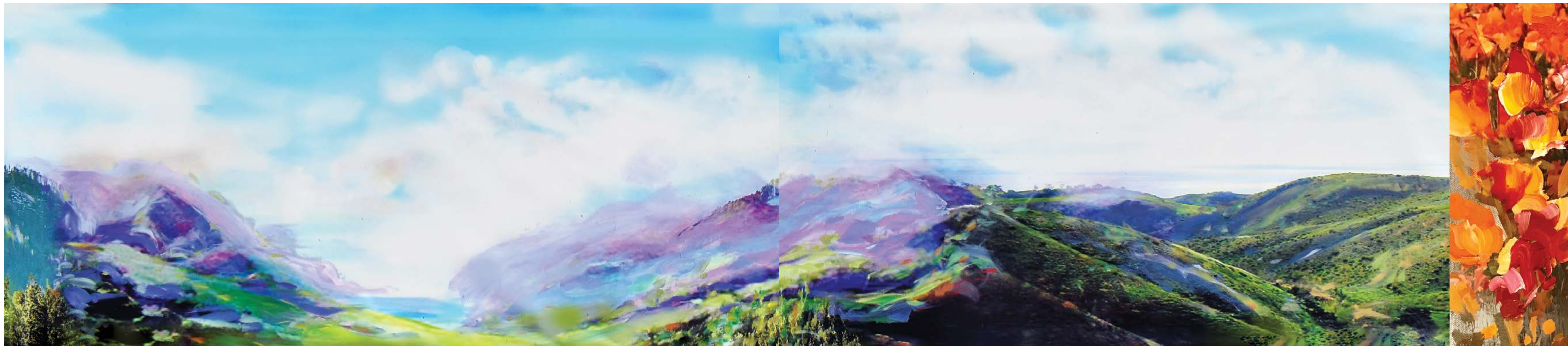
Sacred Spaces 14 , 2021. Latex and Acrylic on Printed Vinyl, 39 x 194 inches