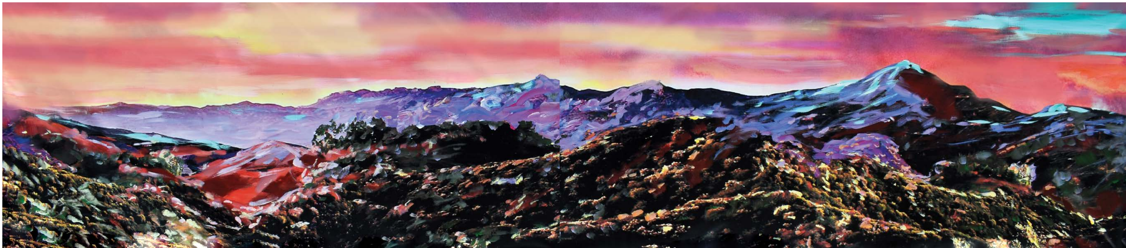
Sacred Spaces 21 , 2021. Latex and Acrylic on Printed Vinyl, 39 x 194 inches