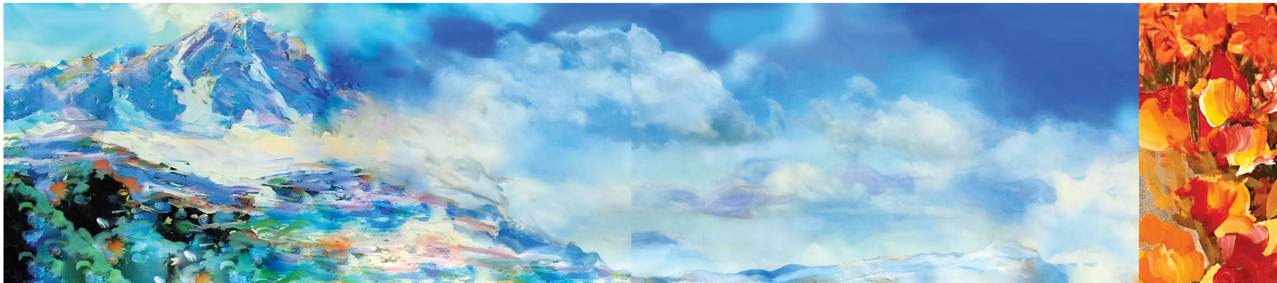
Sacred Spaces 2 , 2021. Latex and Acrylic on Printed Vinyl, 39 x 194 inches