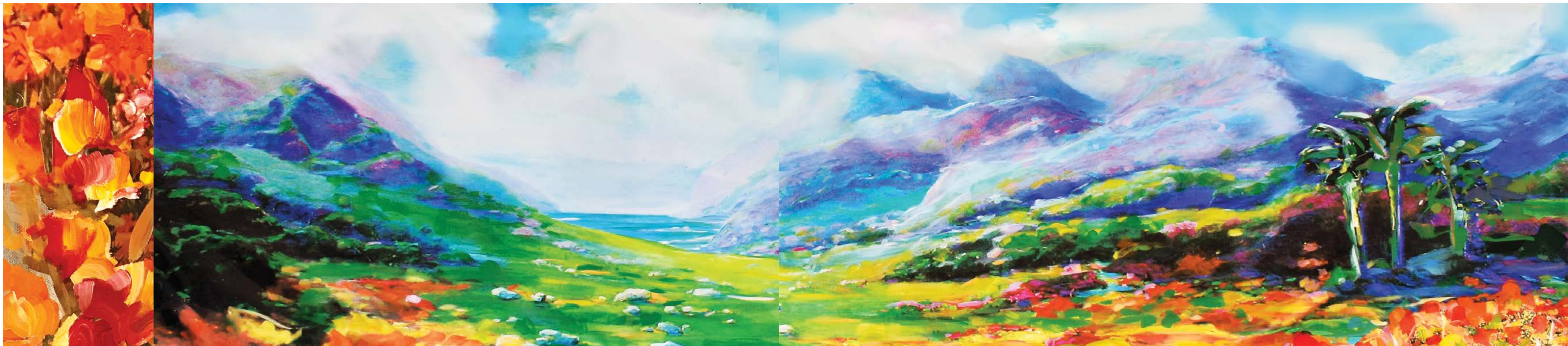
Sacred Spaces 3 , 2021. Latex and Acrylic on Printed Vinyl, 39 x 194 inches