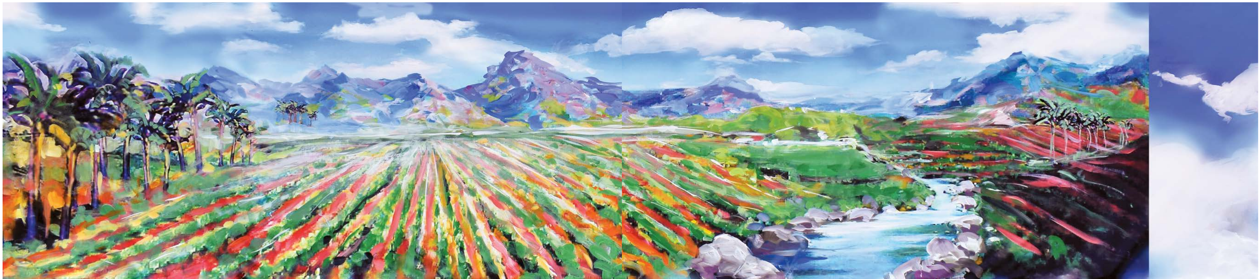
Sacred Spaces 7 , 2021. Latex and Acrylic on Printed Vinyl, 39 x 180 inches