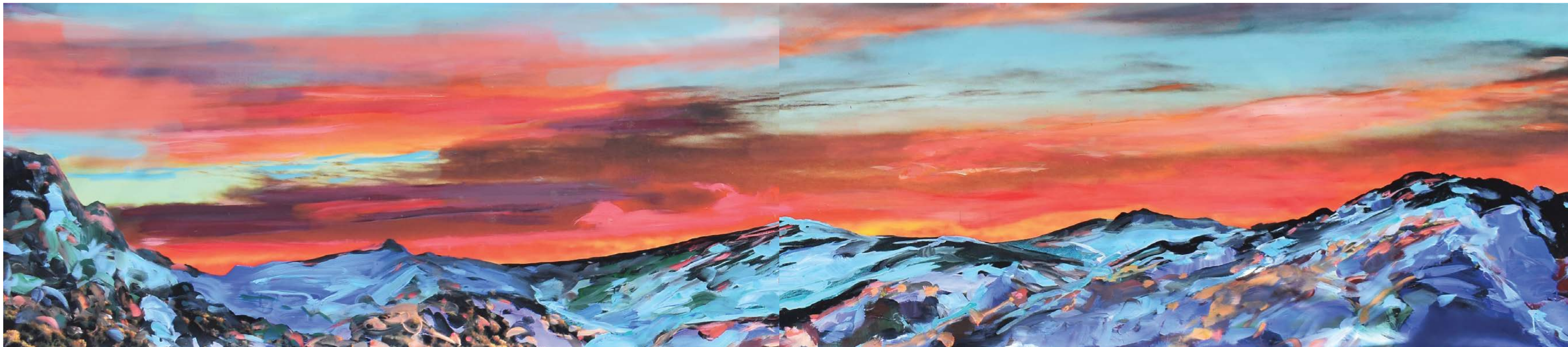
Sacred Spaces 22 , 2021. Latex and Acrylic on Printed Vinyl, 39 x 194 inches