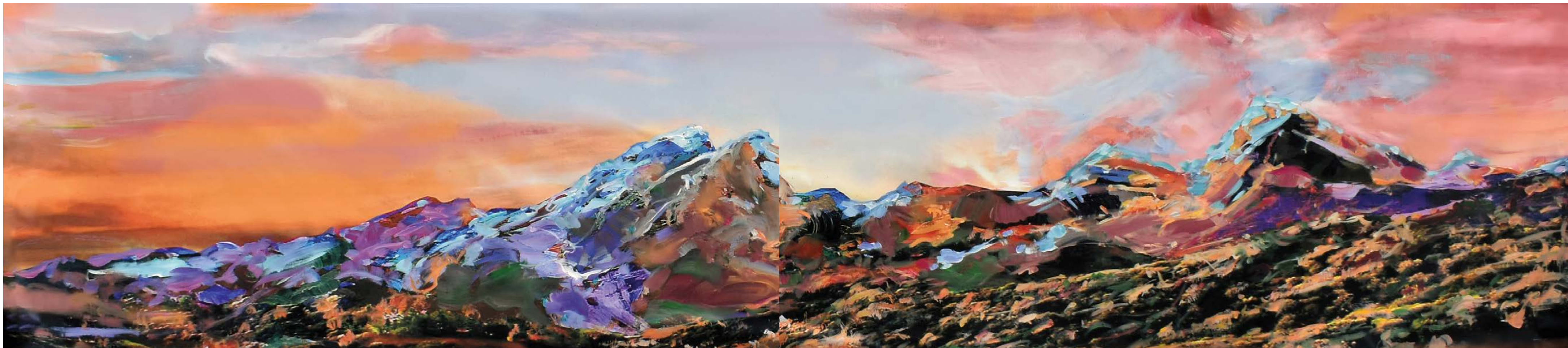
Sacred Spaces 20 , 2021. Latex and Acrylic on Printed Vinyl, 39 x 194 inches